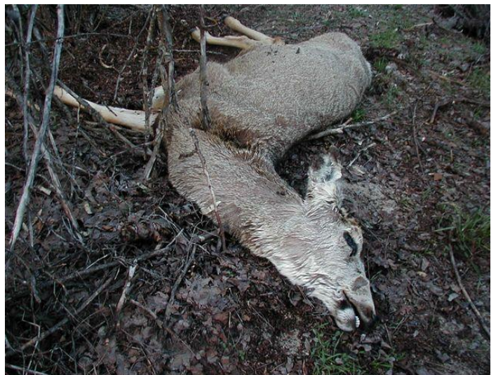
Female mule deer in Garden Valley starved to death above feed sites after IDFG cut feed in half during mid January 2002. Like many others, this animal died when slopes were baring up, shortly after additional feed reduction on March 1 st ..