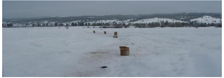
2002 Block stations utilized by 200 elk that IDFG refused to feed.

Deer and elk visit the blocks briefly in small groups, eating approximately ¼ to ¾ pound each daily, and then leaving the area to consume natural forage elsewhere.