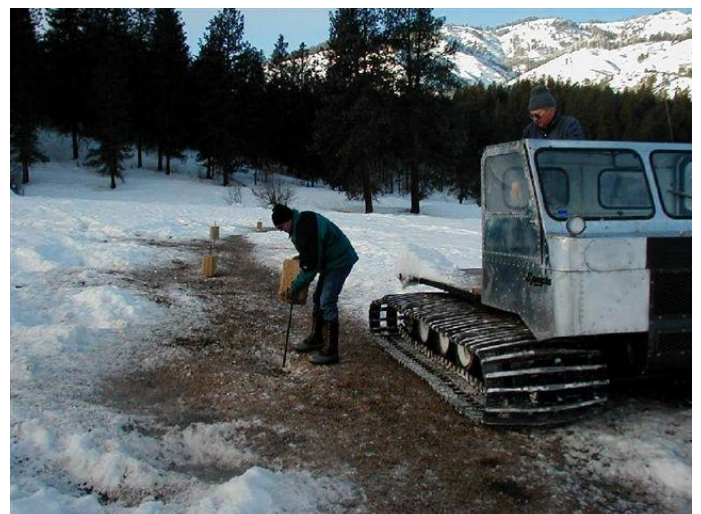
Representative Mike Moyle replenishing blocks where feed was withdrawn from 200 elk by IDFG.

Early use of wildlife energy supplement blocks can compensate, to some degree, for errors in judgment on when to start emergency feeding.