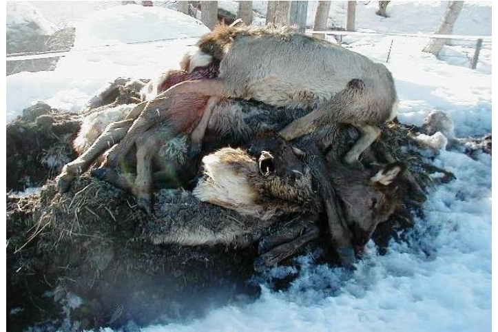
Dead elk IDFG refused to feed in Garden Valley in 2001-02 winter.

In 1927, Sparkman reported seeing more deer and elk in the Lowman Game Preserve (Unit 35), and many times more deer outside the game preserve in Unit 33 than exist there today. From the late 1920s through the 1940s, USFS estimates of total deer wintering along the South and