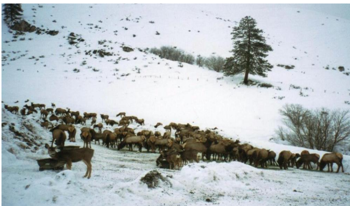
Part of 433 elk and deer fed at the Donley site in 1992-93 winter.

Pressure from hunters during extended hunting seasons often displaces both deer and elk, forcing them to occupy areas outside of their normal winter range. This sometimes results in their joining local herds and creating larger concentrations than would normally occur.