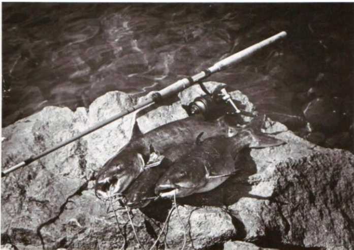
Channel catfish and other non-native warm water species are still abundant in some Idaho rivers, manmade lakes and reservoirs.