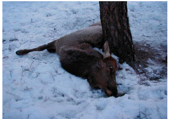
Elk can forage in deeper snow than mule deer but they cannot survive on a diet of pine needles (2002 Garden Valley photo).

When an animal has lost fat and muscle tissue totaling 20-25% of its optimum body weight, its odds of surviving are poor, even if adequate nutrients are provided at that point. Ideally, emergency feeding should begin long before that advanced stage of malnutrition is reached.