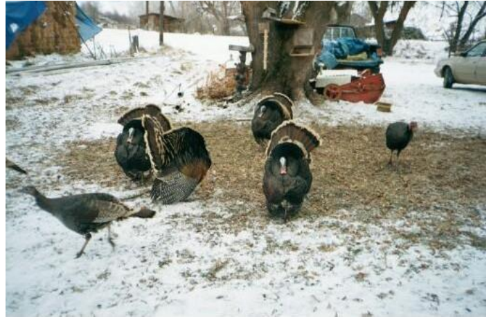
Transplanted wild turkeys are now flourishing in many parts of Idaho due to cooperative efforts between the Turkey Federation and private landowners who voluntarily feed them when winter conditions prohibit their survival without feeding.

With the exception of fish propagation, much of which is funded by federal agencies and private industry, the public perception is that we are paying our wildlife agency $70 million to manage people – not wildlife.