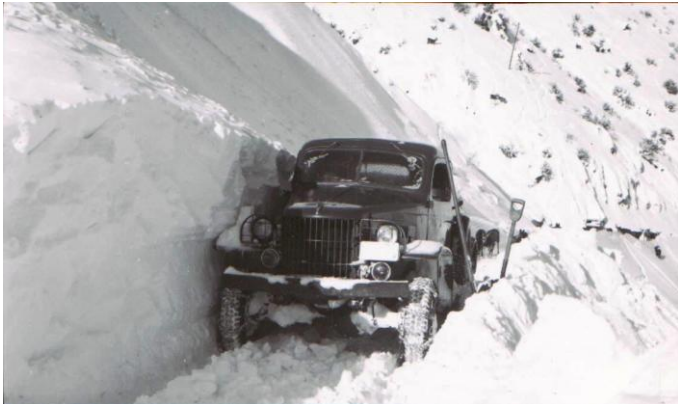
Deer and elk were fed properly during the 1948-49 winter, with feed spread out to provide every animal access.

When the snow melted in the spring, IDFG counts identified only 124 deer that died from all causes, far fewer than were found in a normal winter. Both the Department and local citizens considered the operation a success.