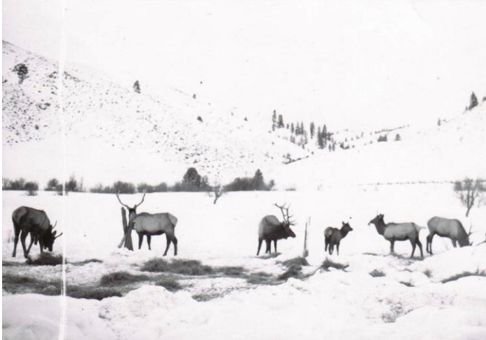
Elk fed properly by IDFG in Garden Valley during 1948-49 winter.

Early reports from the State Game Warden to Idaho's elected officials reveal that emergency feeding of deer and elk during an abnormally severe winter was an important biological tool used to restore big game populations. IDFG records in my files document F&G cutting evergreen boughs to feed whitetails in north Idaho, as well as significant emergency winter hay feeding to mule deer and elk in every Region.