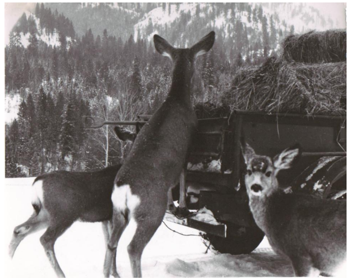
Fat mule deer doe and twin fawns fed properly in Garden Valley during the severe 1948-49 winter.

Allowing a natural disaster to destroy most of the game in some areas automatically redistributes hunters, increasing hunting pressure in other areas that may never require emergency feeding. This “robbing Peter to pay Paul” management scenario is the situation that presently exists in Idaho deer and elk herds, with some regions scrambling to protect their declining big game from hunters who live in another region with too few animals to provide reasonable harvest opportunity.